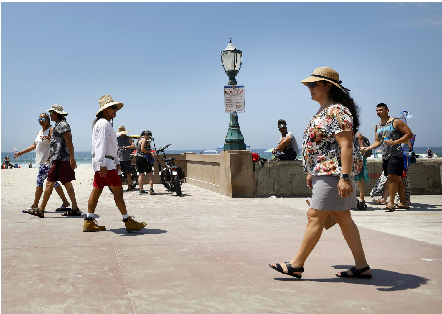
K.C. ALFRED U-T

People walk along the boardwalk in Mission Beach on Thursday. U.S. Census Bureau data from the 2020 count show San Diego County's population grew by more than 6 percent to just under 3.3 million people, and it's more diverse than in 2010.