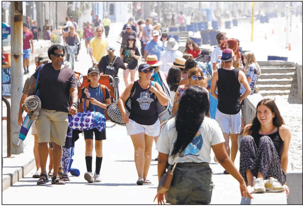
K.C. ALFRED U-T

In the 50th Congressional District — a longtime Republican stronghold that includes parts of East County, communities in inland North County, and a southern portion of Riverside County — there are 33,100 fewer White voters than there were a decade ago. The area also saw a more than 50 percent decrease in Asians